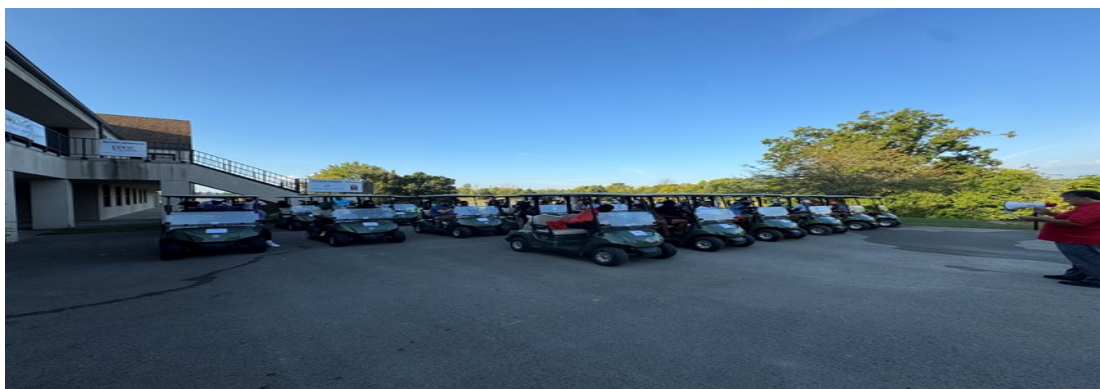
All Golfers—September 6, 2024—Meadowbrook Golf Course