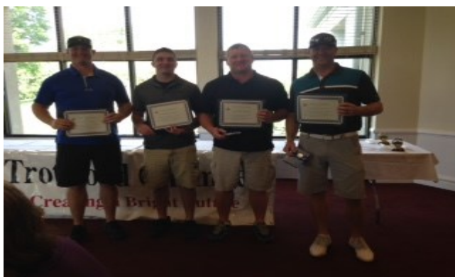
First Place Winners