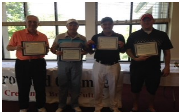
Second Place Winners