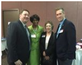
Wright-Patterson Air Force Base Miami Valley Military Affairs Association Annual Get Acquainted Reception April 27, 2016