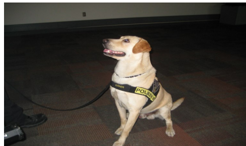
TSA Canine Dog