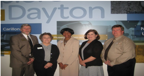
Directors -Left to right: Huber Heights, Northmont, Trotwood, Brookville and Vandalia