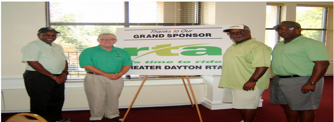
GRAND SPONSOR—GREATER DAYTON RTA