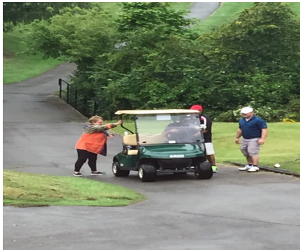
What a Picture! - Who is in control?