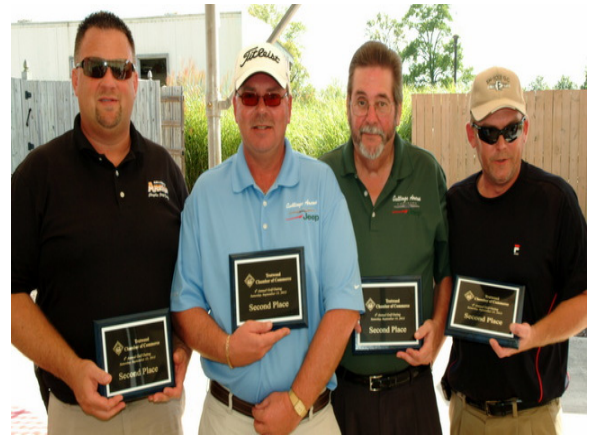
Second Place Winners