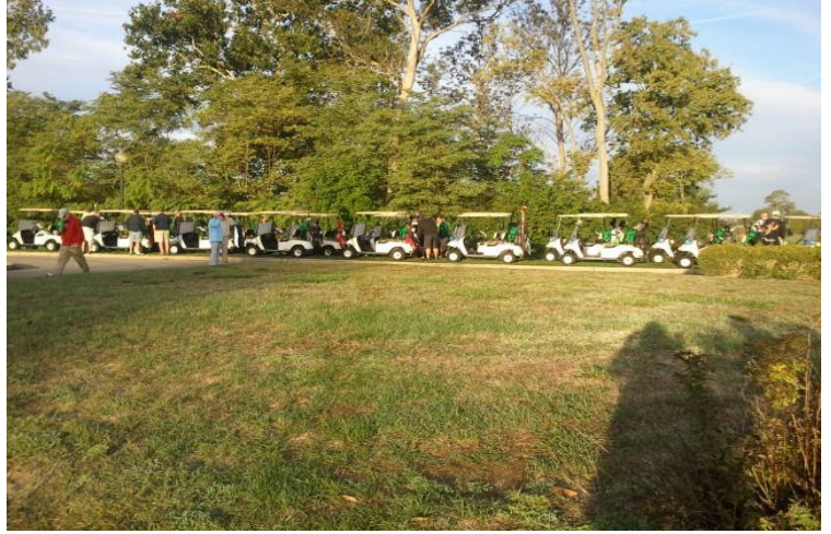
Golfers on their way out