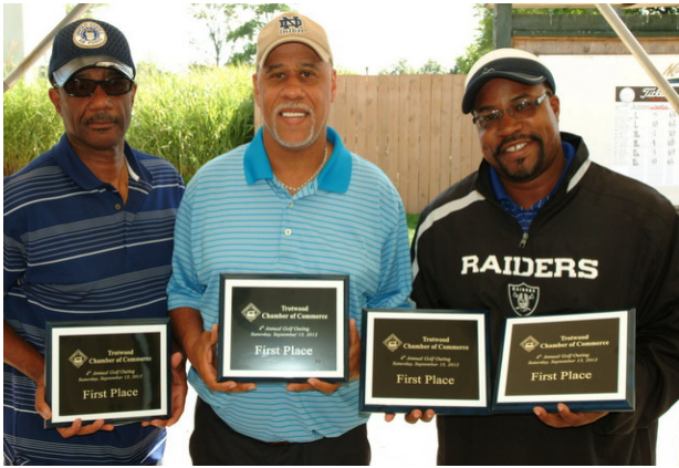
First Place Winners